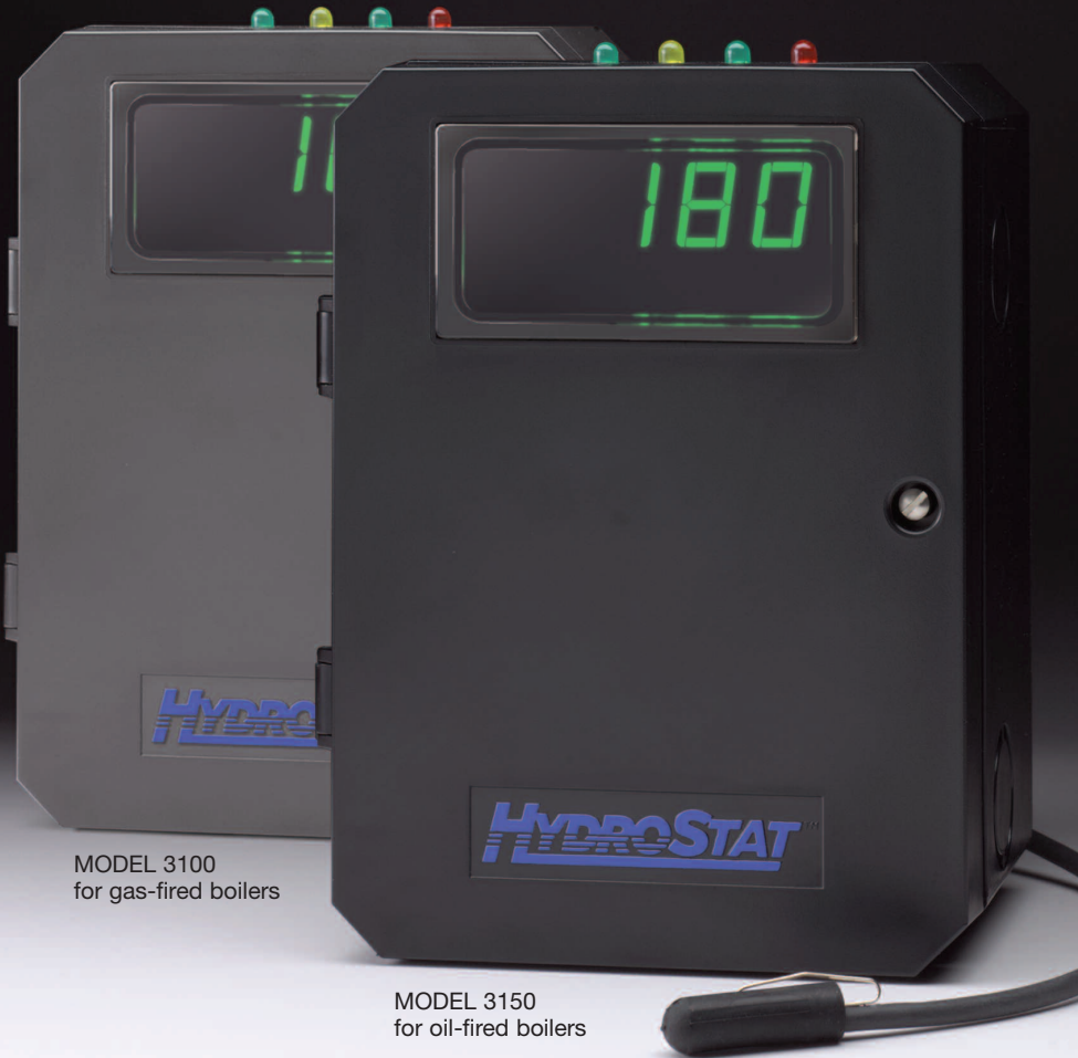
MODEL 3100 for gas-fired boilers

The Universal Temperature Limit and Low Water Cut-Off for Oil and Gas Fired Boilers